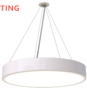
CC Conical Cable Mount