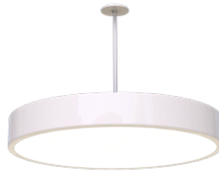
H Stem Mount