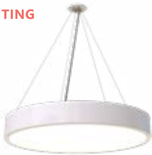
CC Conical Cable Mount