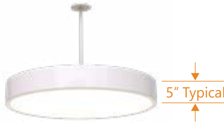
H Stem Mount